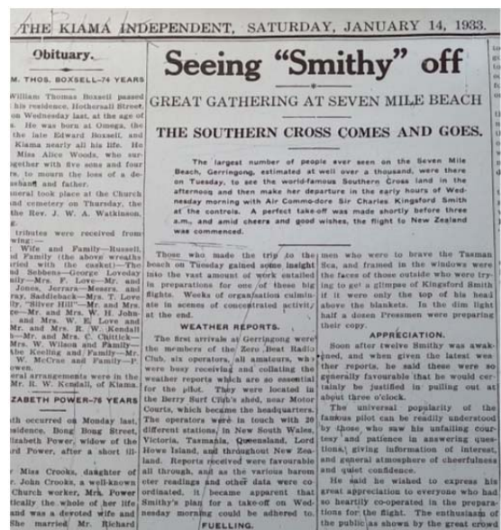
Excerpt from The Kiama Independent on display at the Kingsford Smith Memorial