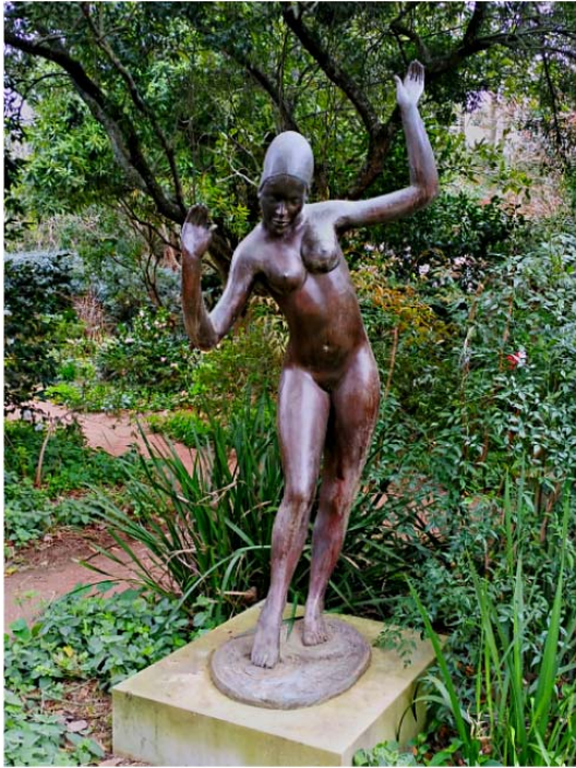
The Swimmer - bronze sculpture

Arthur Boyd was named Australian of the Year in 1995.