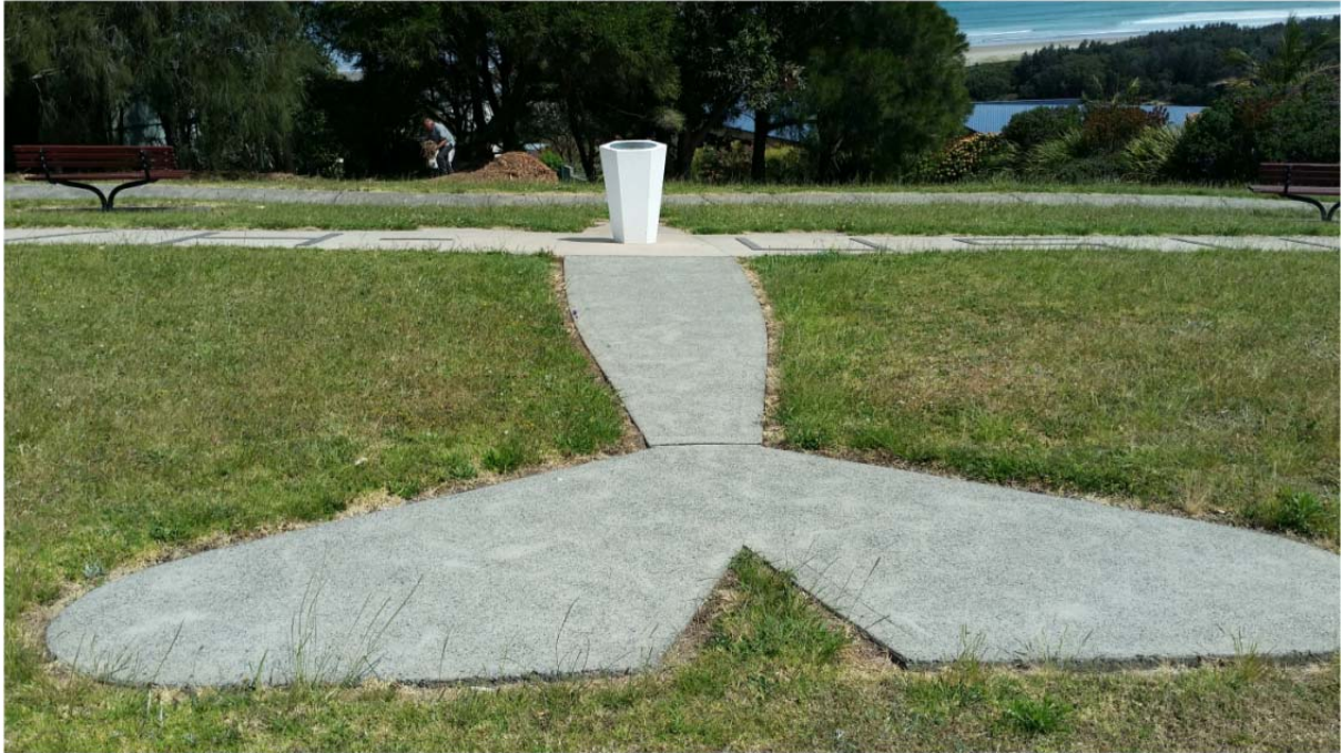
Kingsford Smith Memorial at Gerroa overlooking Seven Mile Beach.