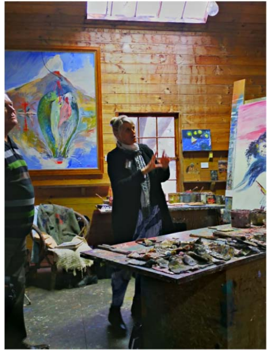
Inside Boyd's studio

Bundanon now conducts an Artist-in-Residence program which is open to professional artists and thinkers from all disciplines, individually or in groups. Each year around 300 artists are able to experience Bundanon Trust's Artist-in-Residence program.